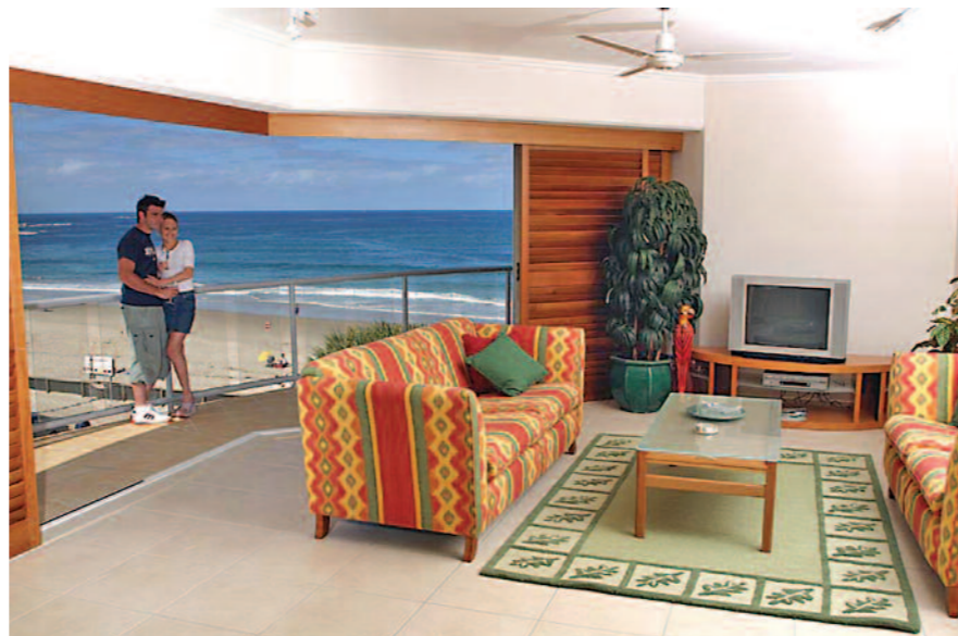
Rolling Surf Resort offers a range of accommodation options and a plethora of facilities.